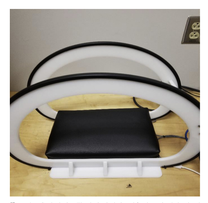
Figure 1 Study device. The device is designed for the patient's head and upper neck to lie in the center of the electromagnetic field created by the Helmholtz coil situated around the headrest. The device connects to an external stimulator, which provides the specified field strength and stimulation frequency.

This was to negate the effects of any acute electrophysiologic remodeling that might have made the patient more prone to remain in AF after the protocol was complete, which could have reduced the efficacy of the procedure.