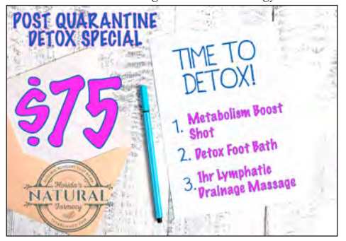
Metabolism Boost Shot • Detox Foot Bath Lymphatic Drainage Massage